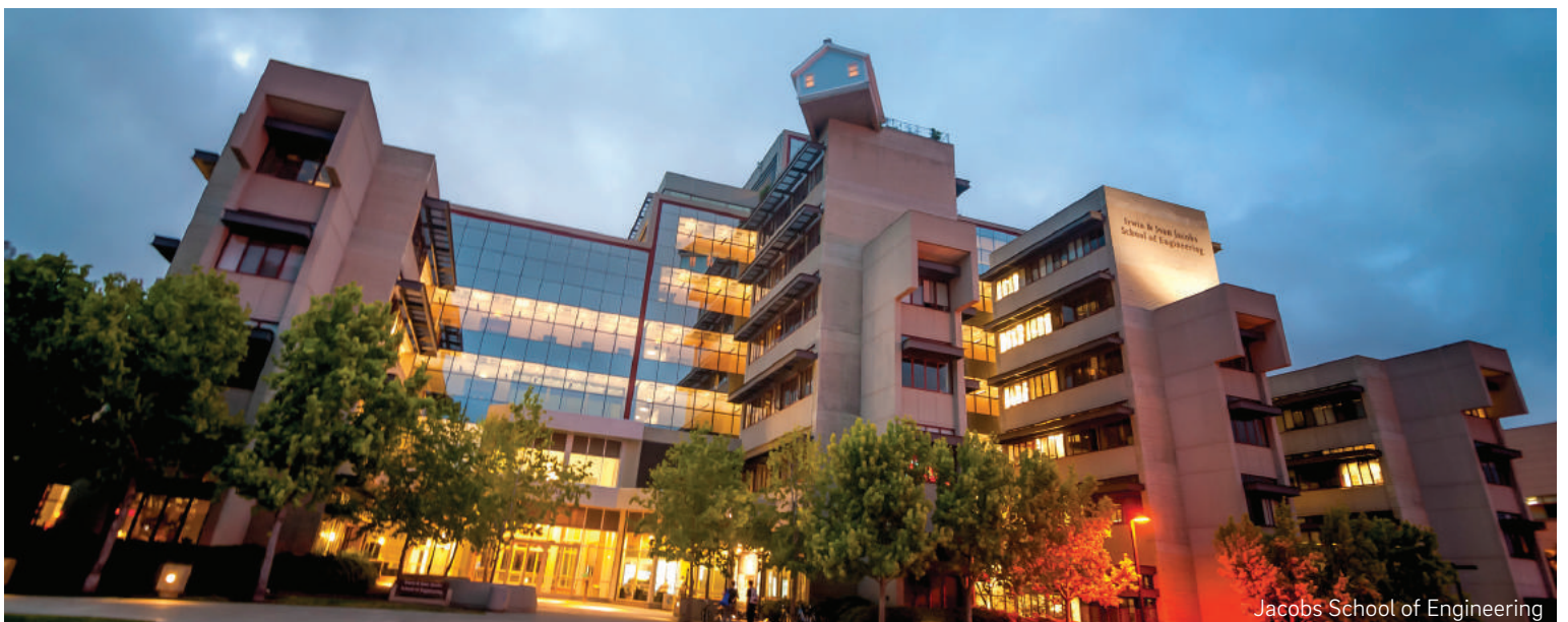
Jacobs School of Engineering