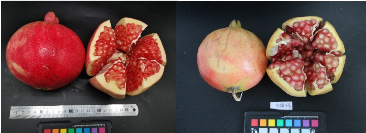
图 1 酸美(左)与突尼斯软籽(右)果实性状对比 Fig. 1 Comparison of Suanmei (left) and Tunisiruanzi (right) fruit character

对照突尼斯软籽相比,籽粒鲜红色(图1),汁多味酸甜,出汁率88.2%(籽粒榨汁质量/籽粒质量),核仁超软(硬度 1.4\text{ kg}\cdot\text{cm}^{-2} )可食用,嚼后残渣少。可溶性固形物含量15.9%,可溶性糖含量11.9%,抗坏血酸含量 8.89\text{ mg}\cdot 100\text{ g}^{-1} ,总酸含量(以柠檬酸计) 18\text{ g}\cdot\text{kg}^{-1} ,氨基酸总含量 8.40\text{ g}\cdot\text{kg}^{-1} ,风味酸甜。酸美石榴与对照品种突尼斯软籽石榴及 Wonderful 果实性状对比见表1。